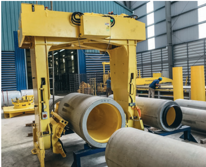
Phnom Penh Precast Plants is currently using the Perfect Pipe technology in the inaccessible diameter range up to DN 700

Munich. The world's largest construction industry trade fair also offered the owners and representatives of Phnom Penh Precast Plants the opportunity to reassure themselves that Perfect Pipe would put them among the world's innovation leaders.