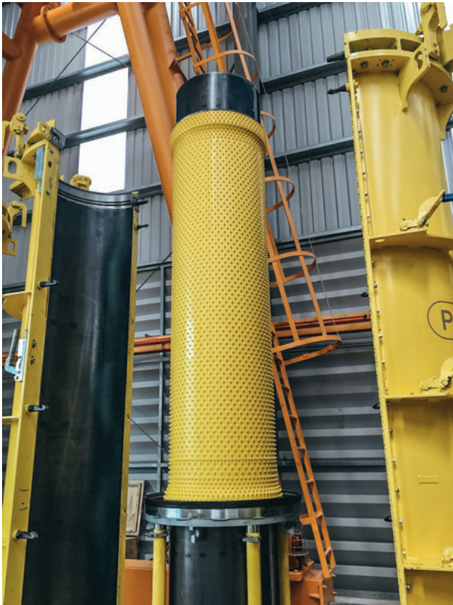
The Perfect Liner is placed on the expandable core