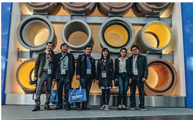
The delegation from Phnom Penh Precast at bauma 2019

"Go for the Best" and "The strength to drive it through" are key elements of Phnom Penh Precast Plants' innovation strategy. On one hand, going for the best demands the requisite expertise in the company's respective service areas. On the other hand, it also requires the will and determination to convince partners in the civil engineering value chain of the benefits of innovation and to leave behind traditional, outmoded practices. The innovation that can be seen at Phnom Penh Precast Plant combines both elements. And Phnom Penh Precast Plants' entrepreneur role in its home country manifests itself in multiple ways, including recognition by local media or through its membership in international associations.