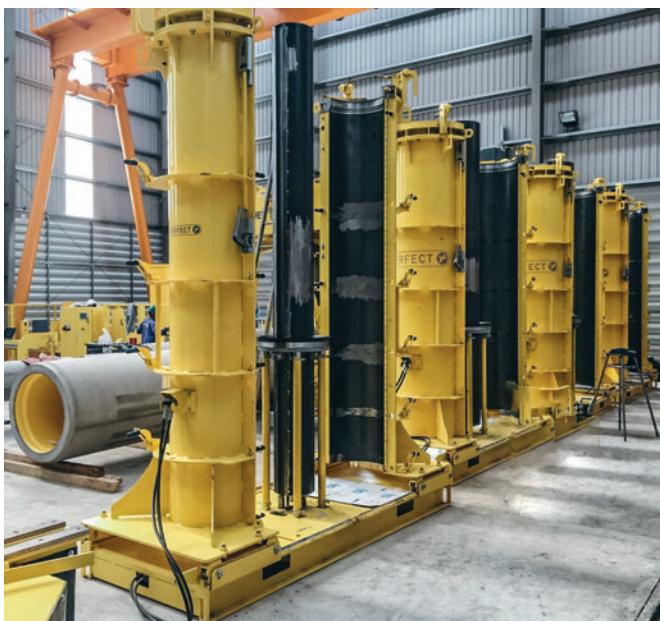
User-friendly molds of the category Perfect Forming Technology from Schlüsselbauer in production at Phnom Penh Precast Plants, Cambodia

The relevant dimensions of the robust pipes needed for the current civil engineering market in Cambodia for trenchless installation/microtunneling range from DN300 to DN700. According to the project requirements, the pipes can be produced with overall lengths of 2 m or 3 m. In each case the required length of the HDPE liner is first cut of a coil, rolled and welded into a cylinder. To create a flexible joint in the finished pipe, both ends of the cylinder are expanded in a thermoplastic process. The resulting recess, formed at both ends of the cylinder is exactly dimensioned for insertion of the plastic connector, which reliably seals the pipe against leakage and water ingress with two external gaskets. This technology eliminates the need to weld the pipes on the construction site as