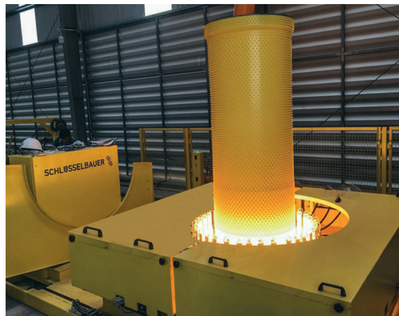
The thermoplastic forming of the liner cylinders is an essential step in the production of Perfect Pipe