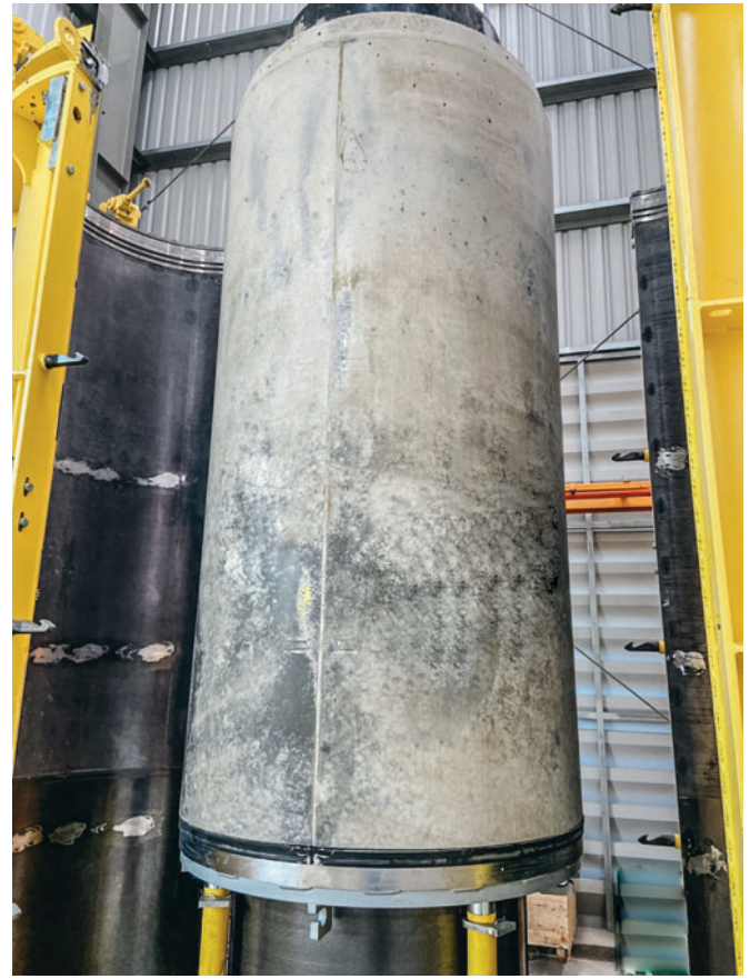
Perfect Jacking Pipe—cured after a few hours in the casting mould

the pipes are already joined with connectors providing a sealed and ready-to-use pipeline. This is all the more important in pipe jacking since welding works on site need significant subsequent labor and safety measures which represent an enormous cost factor.