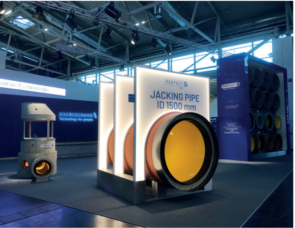
Schlüsselbauer's bauma 2019 exhibition in Munich was jam-packed with high-quality precast concrete parts and technological innovations.

this: "Monolithic concrete elements and corrosion protection are not at odds with one another, but can complement each other perfectly. This creates more value in the concrete plant." Another conclusion was this: "The future success of precast concrete part manufacturers will also require going off the beaten track from time to time."