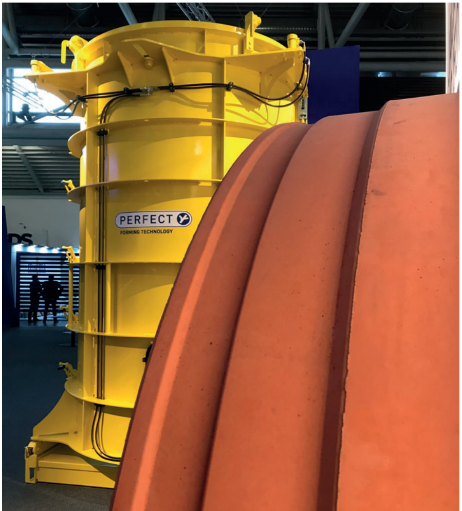
The custom-fit design of the pipe with a sealing chamber at the tip end demonstrates the possibilities offered by the sophisticated Perfect Forming Technology manufacturing system.