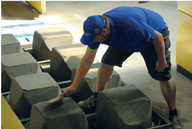
The manufacturing system is designed to be operated by a single worker.

reliable production method, even as it became increasingly important to boost capacity and, at the same time, modernize this production.