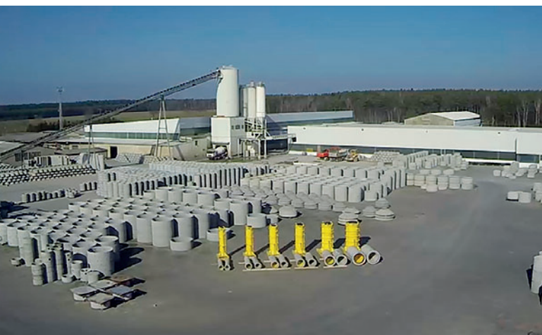
Presentation of the Perfect Pipe concrete-plastic composite pipe at Grafe Beton's factory site in Stölpchen, near the German city of Dresden.

Grafe Beton is a family company founded in 1903. It currently supplies customers far beyond the borders of the federal state of Saxony, where it is based, in countries such as the Czech Republic and Poland. Grafe Beton was awarded the Saxon State Prize for Quality and the title of "TOP Innovator 2011" in recognition of its continuous development and innovation, as reported in CPI 5/2012.