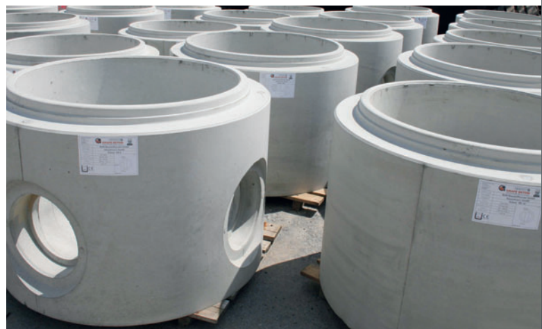
The Perfect concrete manhole bases are monolithic and produced in one pour - custom fabrication with the efficiency of an industrial manufacturing process.