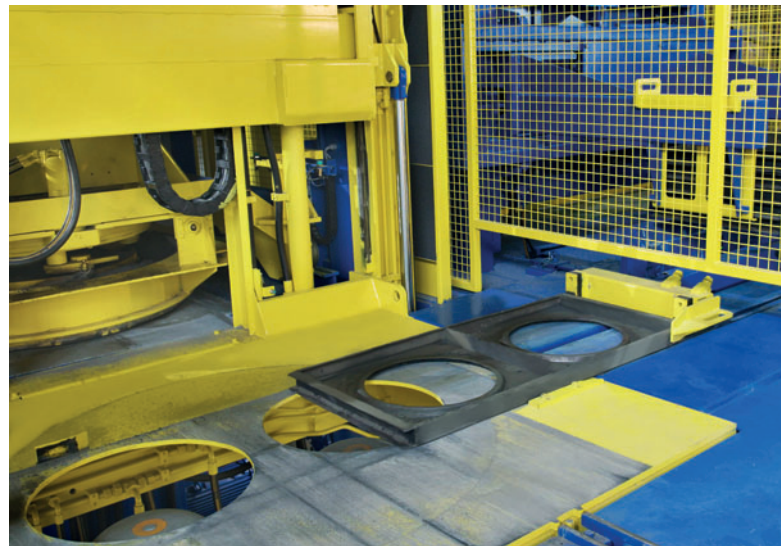
Automatic feeding of the bottom pallet into the production system.

If the production volumes exceed current requirements, production can be switched over to another type of drain part within half an hour. This is all the more important as it enables the company to react to short-term fluctuations in requirements and also prevents them having to produce and store additional volumes of less popular components. In addition to changing the outer moulds, the cores can be quickly mod-