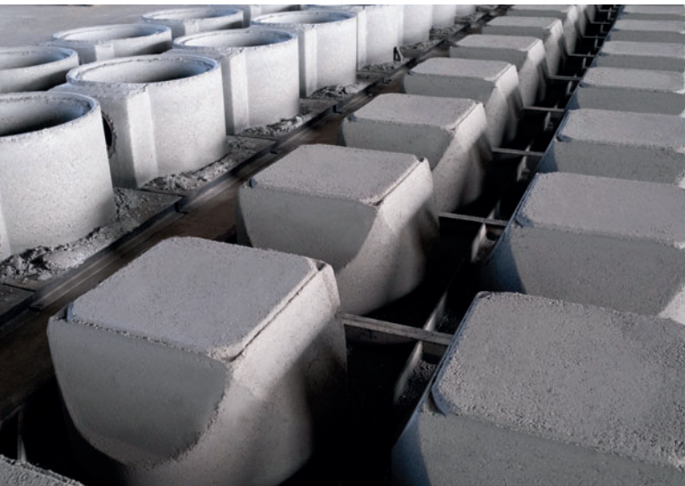
Products in the hardening area of Grafe Beton's production hall.

rapid and gentle, and enables the products to be set down in a space-saving way. If the drain parts are not equipped with installed parts that have to be continually fed into the machine by the worker, only a single worker is required for the entire production process, including the moving of the components to the hardening area. The production process in the machine takes place fully automatically and without any intervention by the operator.