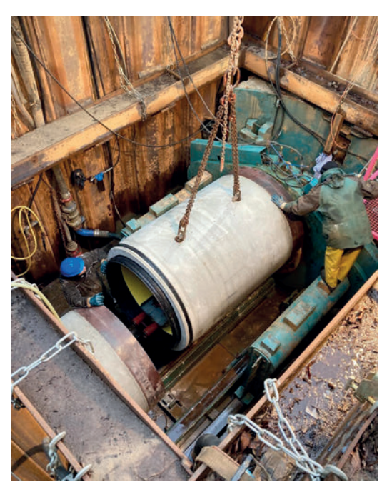
Space is usually at a premium in pipe jacking operations. This makes the Perfect Jacking Pipe even more advantageous, as a complete, corrosion-protected pipe system is created as soon as the next pipe is inserted.

on the market. Schlüsselbauer Technology has reacted and contributed to this trend by placing special focus on constantly developing and improving this type of mould. Pipes produced using a mould hardening process with consistent quality from the tip end to the joint have largely replaced dry-cast products for pipe jacking. And even when directly compared with other pipe materials, robust yet high-quality concrete pipes are increasingly preferred.