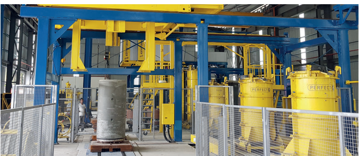
Automated production plant in Malaysia specializing in Perfect Jacking Pipe—a detailed report on this was published in CPI 2/2018.

The production of jacking pipes can be designed to be highly efficient in both cases—either as a specialized production exclusively for pipe jacking or as an additional feature alongside an established production process for mould-hardened products—with or without HDPE lining.