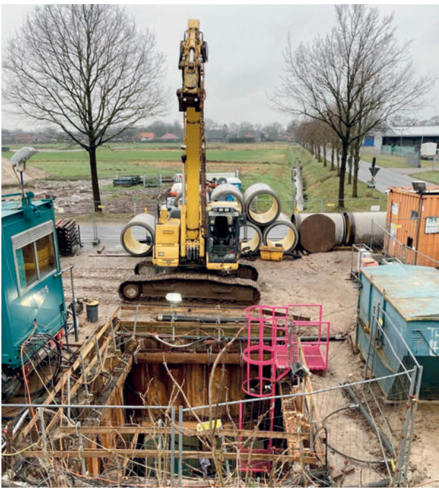
Typical Perfect Pipe construction site store (Haren, Deutschland). The first Perfect Pipe DN 1200 jacking pipes in Germany were installed here in 2021.