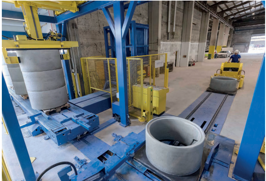
Manhole rings up to DN1500 are produced on the Magic 1501, first installed in 2021, as reported in detail in CPI 01/2022.