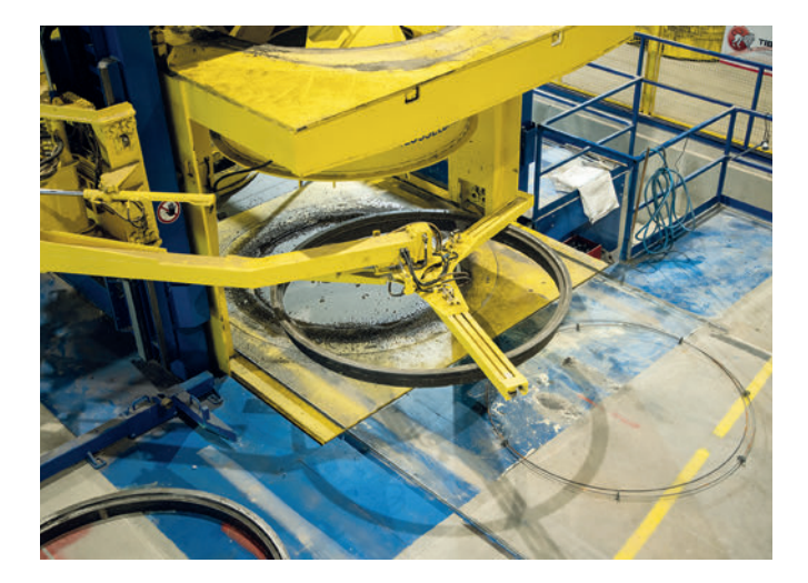
A steel bottom pallet is automatically transferred to the machine for each production cycle.

vibration cycles and frequencies, and acceleration values are stored in the machine program for each product. This means that the operator can access all the necessary product settings at the push of a button right from the start, even after the product – and therefore the mould – have been changed.