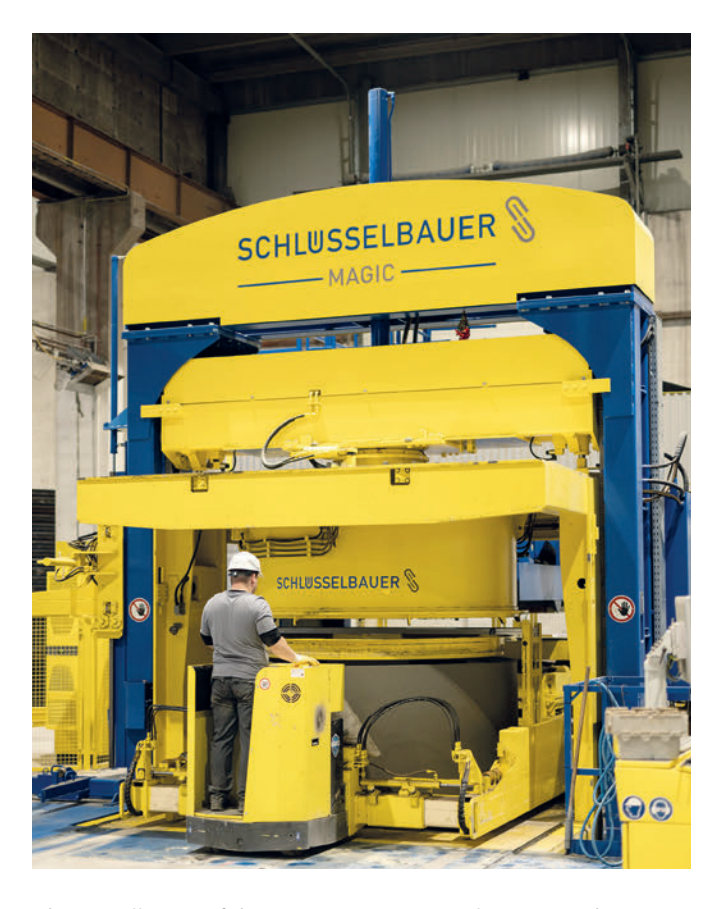
The installation of the Magic 2500 is a milestone in the site upgrade work at Tiba Austria GmbH in the Greater Vienna area.

This also applies for the quick-change mould system, which enables the machine to be converted in under an hour. Thanks to the high level of flexibility provided by the Magic series, Tiba Austria GmbH will also be able to easily manufacture other products on this machine in the future if need be.