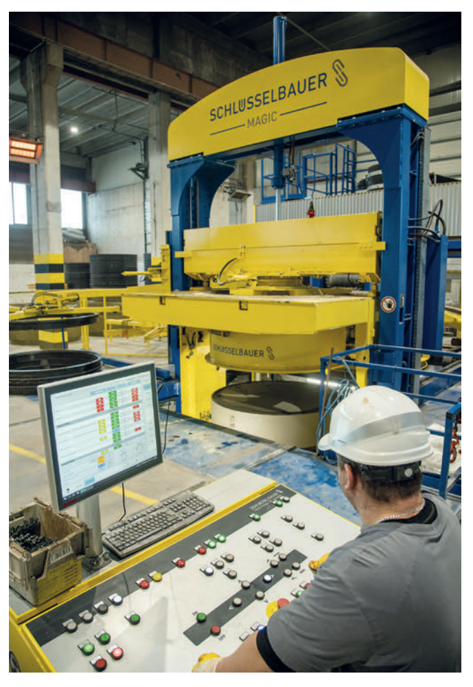
In order to ensure the fresh product is demoulded carefully, the mould and the press unit are raised in cycles.

At the time of start-up, the new Magic 2500 at Tiba Austria GmbH was used to manufacture manhole risers and cones with the nominal widths DN 2000 and DN 2500. The manhole risers are available smooth or with built-in sleeves for step rungs to be installed later on. There is also a version with perforated manhole risers for soakaway applications. The maximum construction height of the manhole risers of both nominal widths is 1000 mm. The construction heights of the cones are 800 mm for the nominal width DN 2000 and 900 mm for DN 2500. Just like the manhole riser moulds, both cone moulds are equipped with hydraulic reinforcement ring centering. This not only ensures that the reinforcement ring is precisely positioned in the product, it also makes the rings easier to insert. For secure and space-saving storage, both cones are shaped to fit the external contour with different sized stacking lugs.