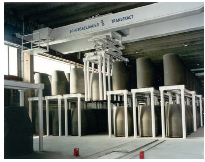
Signs of a successful long-term partnership: Perfect manhole base production system installed in 2014, Exact manhole cone production system installed in 1998.

The longevity and reliability of Schlüsselbauer Technology's machines is plain to see at the plant in Sollenau. Back in 1998, a previous Maba Group company installed a fully automated Exact manhole component production system at the same site. To this day, manhole rings and cones up to a construction height of 2100 mm are manufactured in one-man operation on a daily basis. The entire handling process for the fresh and cured products is fully automated and is carried out using a Transexact crane robot and a connected pallet management system, including cleaning, oiling, and storage. In 2014, after the site was taken over by Tiba Austria GmbH, a Perfect monolithic concrete manhole base production system was installed, followed by the Magic 1501 manhole ring system mentioned above. Tiba Austria GmbH currently employs 150 people at five production sites for precast concrete parts in Austria and generates an annual turnover of approx. 38 million euros.