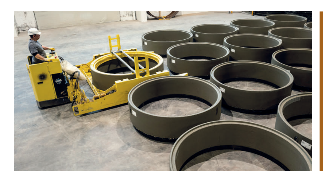
Fresh products are carefully transported to the curing area using an electrical cart for transportation and a set ring manipulator.

Fresh products are transported from the machine to the curing area by a worker using an electrical cart. To protect the manhole riser joint, a set ring mounted on the electrical cart for transportation is placed on the fresh product and removed again in the curing section once the product has been set down; this can be done without the assistance of another worker. Once the products have been delivered to the exter-