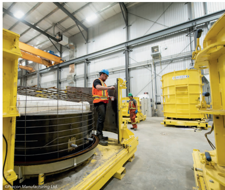
Setting up the channel, climbing aids, and reinforcement in the wall and floor.