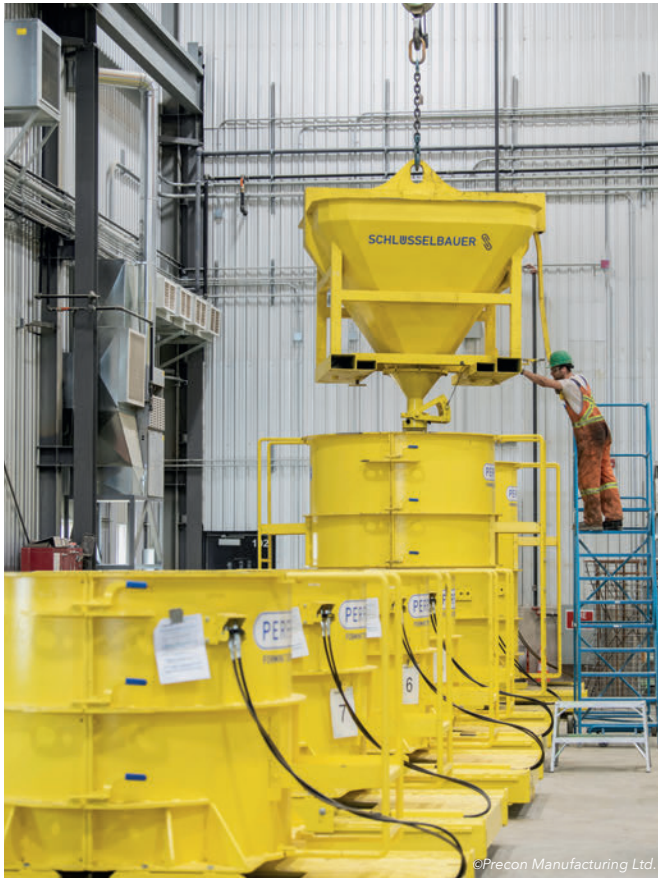
Moulds for different construction heights are filled with SCC.