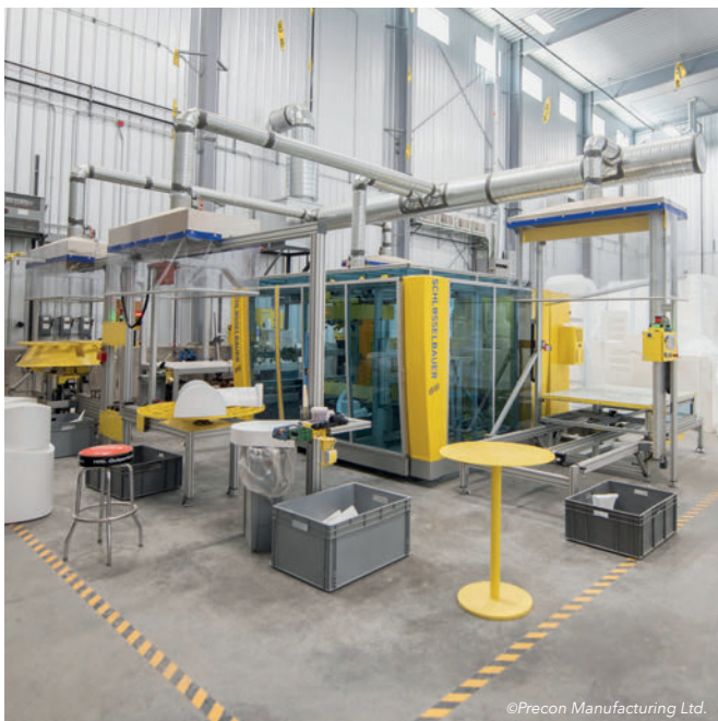
Cutting moulded parts to size—the cornerstone of the Perfect production process at Precon Manufacturing Ltd.

Material engineering is one of the two keys to solving the problem. Schlüsselbauer Technology, too, recognized that advancements in concrete technology over the past few decades were an opportunity to implement new production processes. Unlike vibrated earth-moist concrete, self-compacting concrete enables the use of lightweight moulded parts to make channel shapes and pipe connections to meet any requirements. This suitability, which is essential for de-