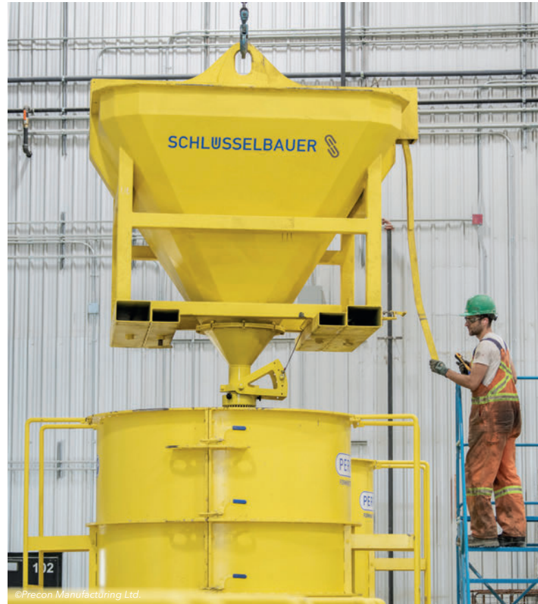
The mobile concrete silo can be operated using a hall crane or forklift.

velopment at Schlüsselbauer Technology, proved helpful for Precon Manufacturing Ltd. in two ways: Not only did the use of SCC make it possible to use the Perfect production system, but it also made it possible to easily meet the requirements for leakproof components.