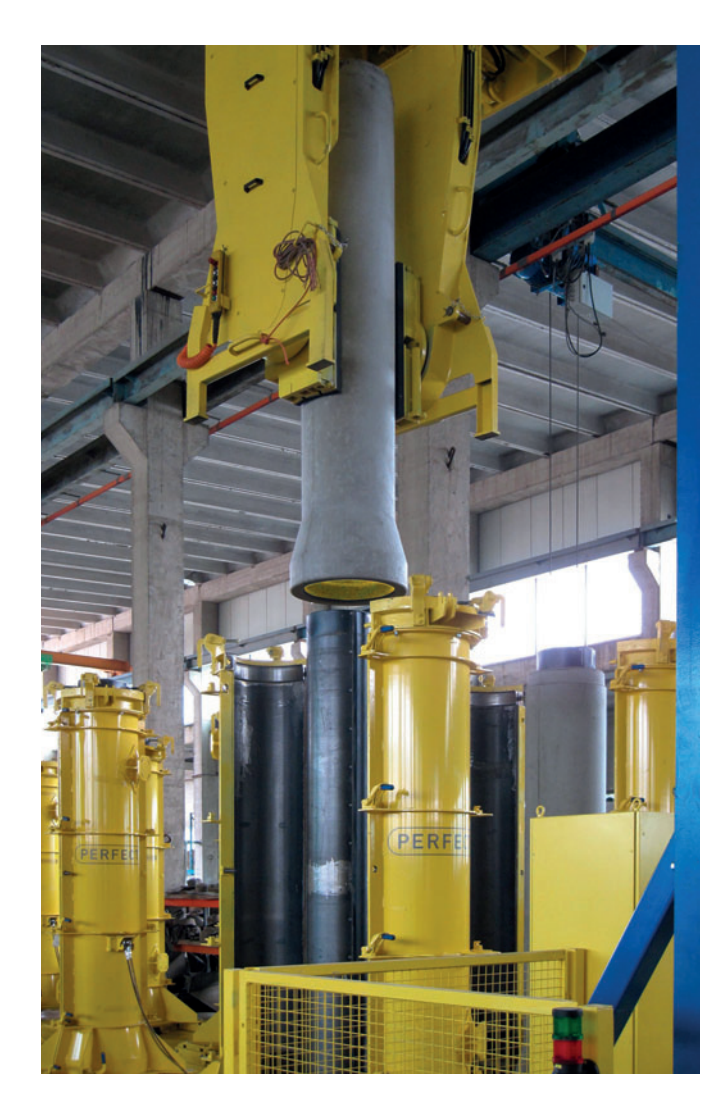
Using Schlüsselbauer's Perfect Forming Technology makes high quality concrete pipe production quite comfortable: The cured product can be easily stripped from the mould independent from degree of automation.

So it was quite a short assessment and decision making process before it was clear Perfect Pipe should become an important element of the company's future growth plan. In addition to being able to provide this concrete wastewater pipe for open trench installation, Geneva also joins Canada in its ability to offer Perfect Pipe for the fast growing pipe jacking industry. Especially in trenchless installations, Perfect Pipe brings numerous benefits to all parties involved. The installation process is much faster compared to lined pipe where the plastic liner has to be welded on site, resulting in either long lasting interruptions of jacking when welding has to be done in the starting pit or quite expensive welding work inside the completed pipeline. Also, compared to other pipe materials, Perfect Pipe provides installation advantages since its a robust concrete pipe with all variations achievable from design (wall thickness), calculated reinforcement and even more different qualities in the concrete mix using only self-compacting concrete (SCC).