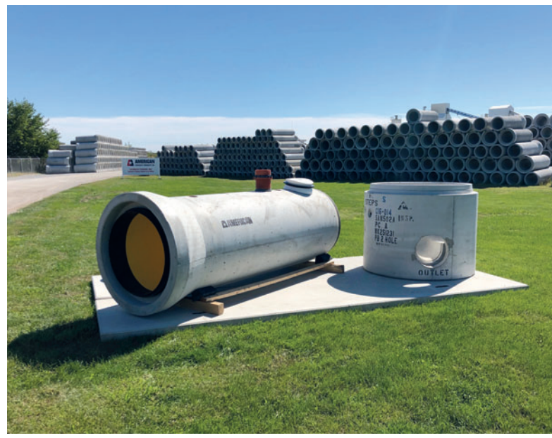
American Concrete Products is proud to demonstrate their new pipe system: Sample pipe with lateral connection professionally made at the plant in Valley, Nebraska