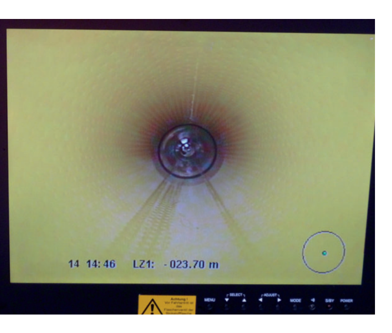
After density testing, the Perfect Pipe installation in Arizona was surveyed by camera inspection after installation and again after one year of usage. All inspections and testing were successful and resulted in the certification of the Pipe system as a confirmed standard.

Another well respected manufacturer of pipe and manhole components, Geneva Pipe, located in Orem, Utah, decided to start with a completely new plant using Perfect Forming Technology for the production of manhole elements, and will soon follow with implementing Schlüsselbauer's Perfect Pipe technology. The decision makers at Geneva watched the first installation of Perfect Pipe in Pima County, Arizona, but they had been interested in Perfect Pipe since its inception.