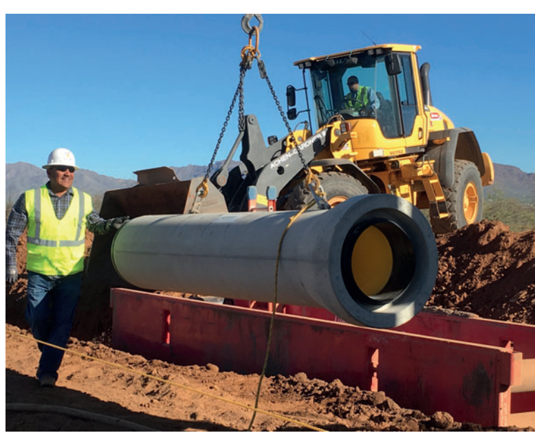
Installation of Perfect Pipe in Pima County, Arizona, in 2017: a considerable number of pipe DN400 (16") was laid in open trench under real installation and usage

CPI – Concrete Plant International – 1 | 2019 www.cpi-worldwide.com