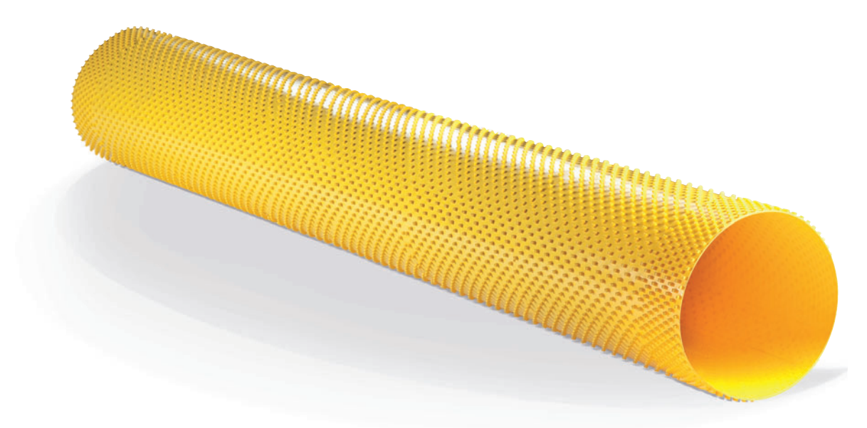
A main element of the ideal long lasting compound of concrete and HDPE liner: numerous anchors on the backside of each thin corrosion protection plate/cylinder