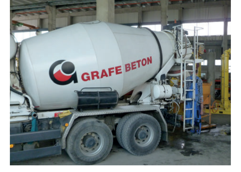
The concrete is mixed using trucks to produce jacking pipes and poured into the moulds using a pail

with pipeline construction back to our own sites. And, as has already been observed, Perfect Pipe also re-creates the potential for precast concrete manufacturers from various sectors to enter the pipe manufacturing sector.