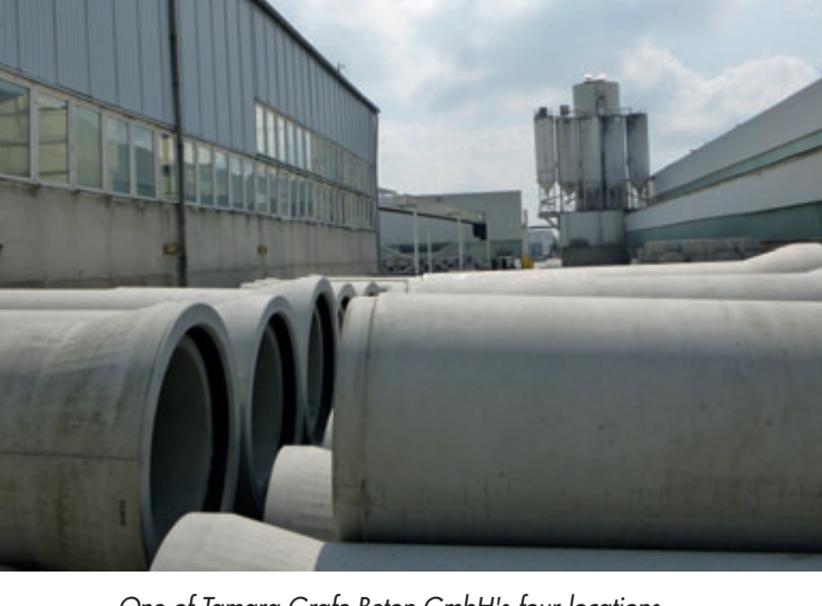
One of Tamara Grafe Beton GmbH's four locations – the site in Stölpchen

Producing jacking pipes was not originally a priority for Grafe Beton. It was only when it came to finalising the design of the Perfect Pipe production between Grafe Beton and