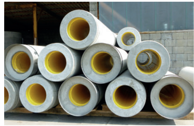
HDPE-lined Perfect Pipe concrete jacking pipes are available from DN300

the supplier Schlüsselbauer Technology that it was decided to consider the increasing global significance of this narrow product segment in pipeline construction from the outset. The vast majority of pipes manufactured by Grafe Beton are used in open installations. These can be both wet-cast concrete pipes with integrated gasket and concrete-plastic composite pipes with HDPE liner for use in projects subject to increased chemical attack. For Grafe Beton, it is a matter of preparing to react quickly to two different and often contradictory market trends. On the one hand, not only in Germany is it becoming increasingly common to construct sewage lines using pipes made out of materials other than conventional concrete or reinforced concrete. On the other hand, a large number of markets are practically experiencing a revival of using concrete pipes as a cast and wet-cast component. This can probably be attributed to the use of self compacting concrete (SCC), which allows a variety of concrete additives to be incorporated, and products