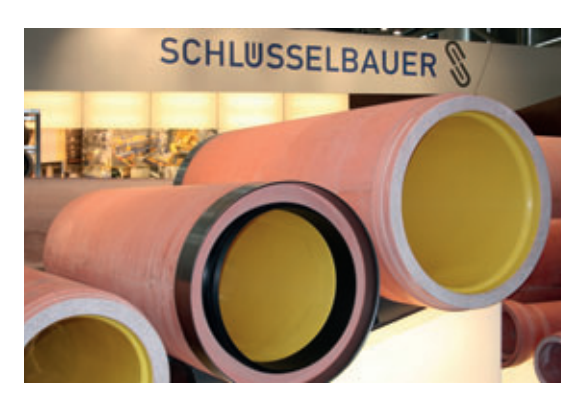
The Perfect Pipe jacking pipes on display at bauma 2013 – from presentation to industrial production in spring 2014