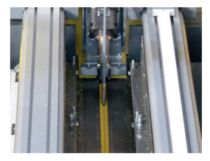
The HDPE liner is welded to a tight pipe liner