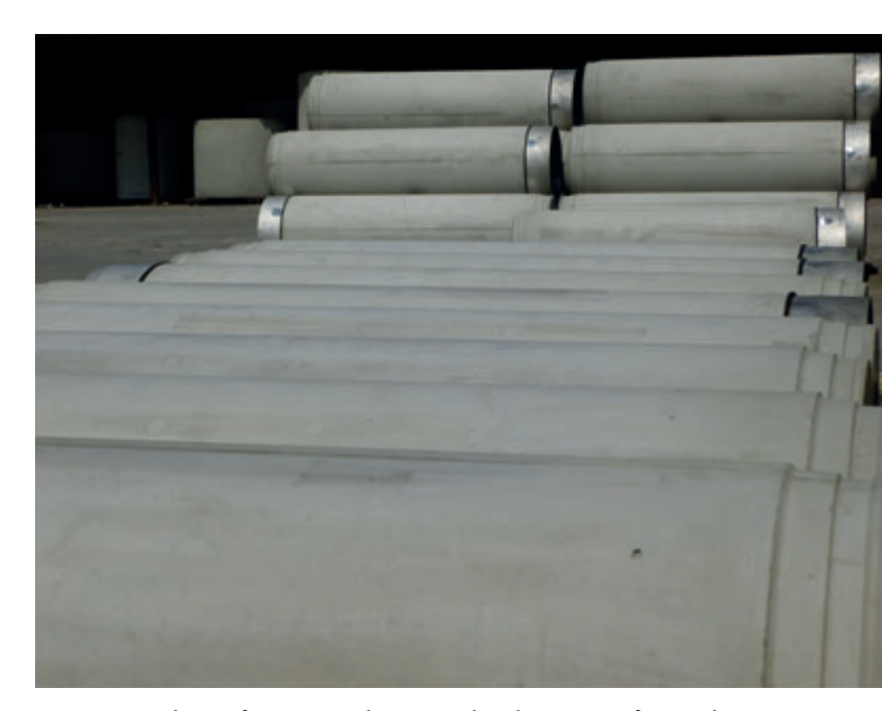
Since 2014 the Perfect Pipe jacking pipe has been manufactured in Stölpchen