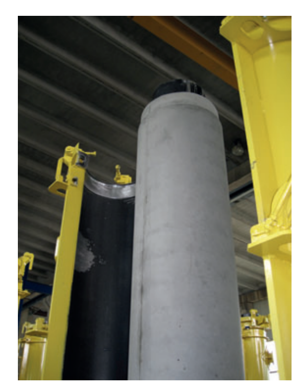
Concrete pipes made using liquid concrete are wet-cast and therefore manufactured to exceptionally low tolerances

corrosion protection, coupled with the structurally advantageous properties of concrete pipes, leads to the conclusion that concrete pipes – whether with or without steel reinforcement – will regain market share in the future. This may be because there is now an additional benefit in regions with traditionally-established concrete pipe manufacturers, or because only now is this flexurally rigid and robust material being fully leveraged in markets in which concrete pipes have hardly been used until this point. In any case, Perfect Pipe represents an opportunity for the precast concrete industry to bring the added value that comes