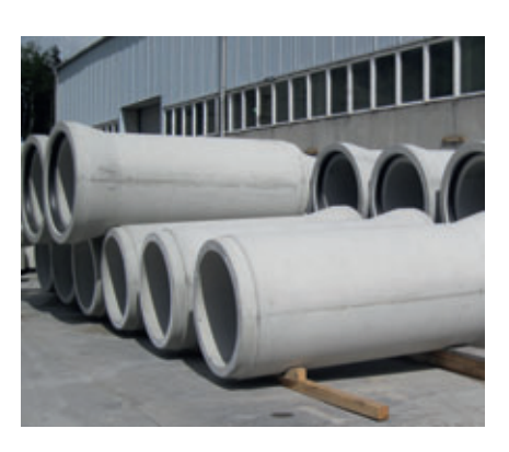
At Grafe Beton, wet-cast concrete pipes are manufactured for open construction up to a nominal width of DN1200