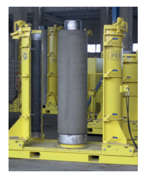
For future projects, the Perfect Pipe jacking pipes are produced to a nominal width of DN300 in 2 m lengths

SCHLÜSSELBAUER TECHNOLOGY GmbH & Co KG Hörbach 4 4673 Gaspoltshofen, Austria T+43 7735 71440 F+43 7735 714456 sbm@sbm.at www.sbm.at www.perfectsystem.eu