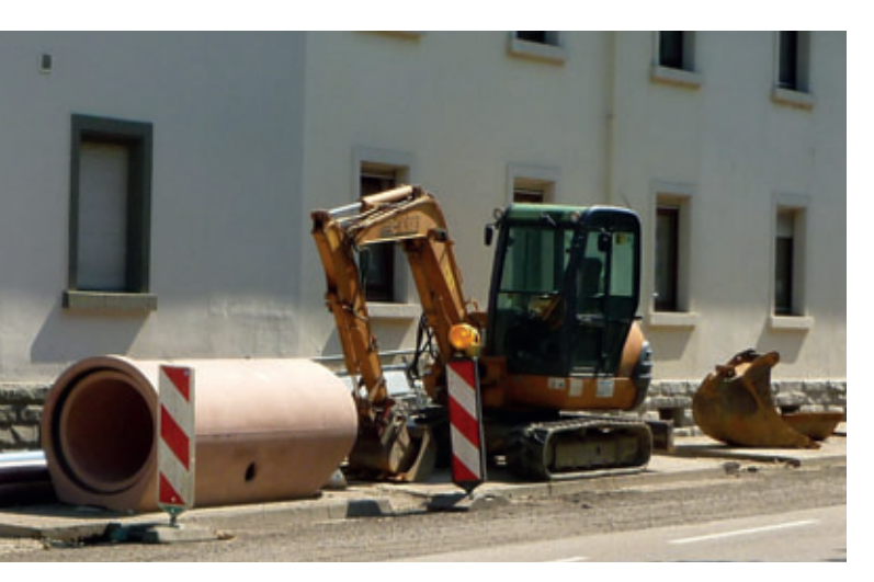
As a basis for an adjacent redevelopment, DN800 prebed concrete pipes were produced in Achern, Baden-Württemberg, some with pre-made connections for side branches on the same invert