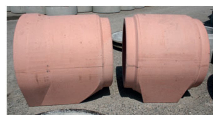
Pipes of the 3 m standard construction length and joint and fitting pieces are made wet-cast in equal measure