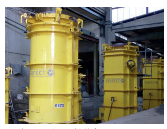
To produce pipes with nominal widths from DN700 to DN1200, Beton Müller commissioned multiple moulds in a lowered hall area