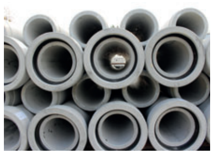
Concrete pipes with integrated gaskets produced with the Perfect Pipe system.

Tamara Grafe Beton is characterised in particular by its more than 160 employees,