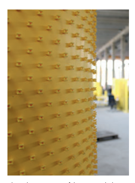
The tight connection of the Liner with the surrounding concrete in the subsequent pipe is guaranteed by multiple anchoring points at the back of the Liner-cylinder.

Currently Tamara Grafe Beton is working with a dozen of casting moulds that are used to produce pipes both for open construction as well as for jacking in nominal widths from DN300 up to DN1000. All pipes can be manufactured with or without Liner – reinforced or not - but always in the same moulds. Short distance and adaptor pipes can also be produced with the Perfect Pipe method. To manufacture different kinds of pipes with only one system, that was also a decisive argument for Grafe