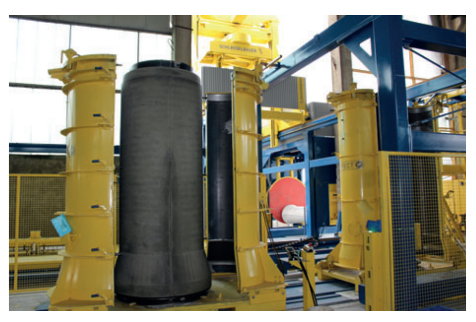
The pipes are carefully released and lifted up from the mould core by a robot equipped with a universal gripper for all pipe diameters.