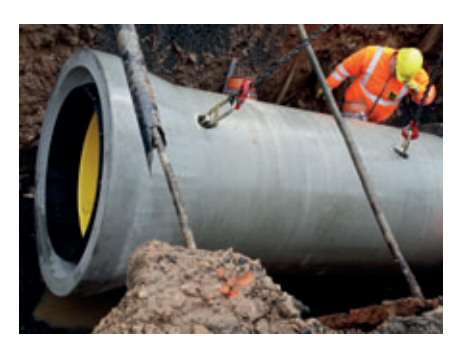
Safely setting down of a pipe into the trench before connecting to the already existing new sewer channel.

The installation of the reinforced pipes lined with HDPE is done in a tried and tested method. First, each Perfect Pipe is lifted up at the pre-integrated anchors by using a chain sling fixed at the excavator and is put down safely in the trench with a maximum depth of 3.5 m. Immediately thereafter, the pipe is carefully pushed towards the existing channel with the help of sliders and is finally fixed, after short application of a lubricant, via the integrated Perfect Connector. Dipl.-Ing. Markus Steinhäuser, responsible site manager of the company Bauer, points out: "The outstanding component quality combined with the unique ease of assembly of Perfect Pipe guarantees a smooth installation. Not least because of the excellent cooperation with Tamara Grafe Beton, which delivers the pipes on time directly to our building site, we are very happy about the fast construction progress!