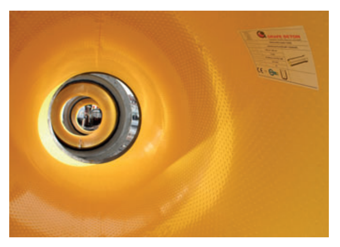
The internal Perfect Liner made from highly durable HDPE is characterised by its long-term resistance against chemical attacks.