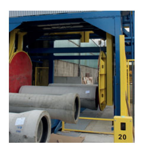
The pipes are consistently checked for tightness.

During this year's bauma - the world's leading trade fair of the the booth from the plant manufacturer Schlüsselbauer Technology were able to convince themselves