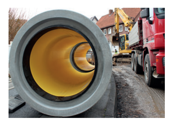
Temporary storage of DN1000 Perfect Pipe reinforced concrete pipes with pre-installed connectors at the building site in Sandershausen, municipality of Niestetal.

Beton. The new sewage channel is distinguished by its higher water capacity and mainly because if its increased corrosion resistance alongside with enhanced static load capacity at the same time. Whilst the removal of the old pipes in need of renovation has been rather difficult because of material damages and rocky soil conditions, all persons involved are enthusiastic about the rapid installation of the new Perfect Pipe system. Furthermore, the workers at the building site are impressed by the overall quality as well as from the well thought out and easy handling of the pipes. Particularly during connecting the pipes via the so called Perfect Connectors, integrated plug-in connectors made from resistant EPDM with double tilting edge gaskets that are characteristic for Perfect Pipe, the whole system shows its strengths, like Mr.