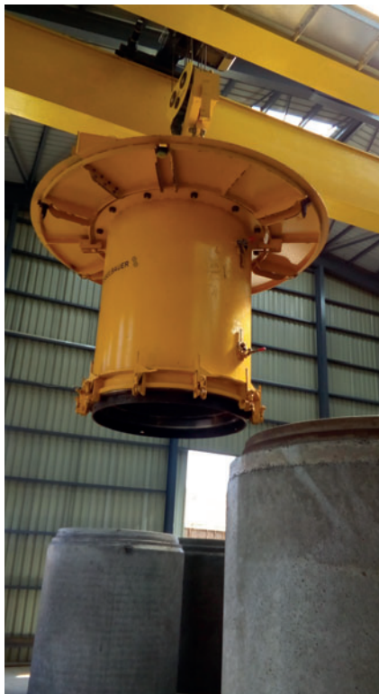
The pipe that has been freshly cast is brought to the setting area using an indoor crane.

The products are transported by an electric removal cart from the manufacturing area to the curing area. The carts have a platform that enables an ergonomic lifting and setting down of the products, in particular to protect the spigot ends of the pipes during transport in the early curing phase. The production machine is equipped with a mould quick-change-system. This means that if a change of size is required during a working shift, the personnel are able to carry this out quickly and easily.