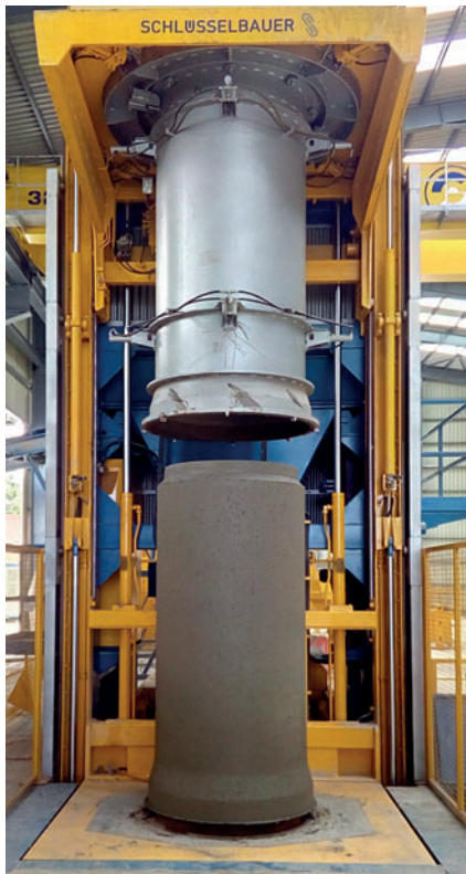
Production of a DN800 bell sleeve concrete pipe using the Precise system supplied by Schlüsselbauer Technology.