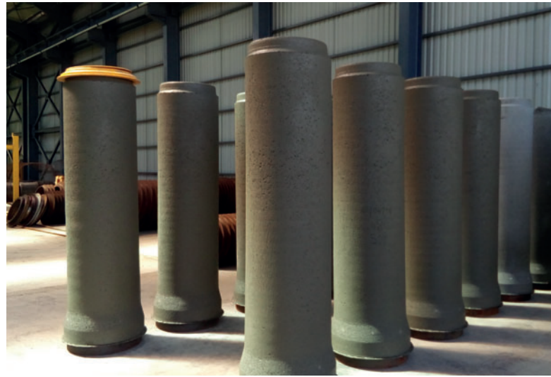
The freshly demoulded pipes usually remain in the curing area of Trans-Canal Centre for one working day.

The Exact XL system makes it possible to produce concrete pipes with the lowest possible conversion work. What is more, the use of upper sleeves guarantees a very high product quality right down to the spigot end of all product types and accurate joints, whilst maintaining very low tolerances. The maximum product length for this type of system is 3,600 mm. In the case of the Trans-Canal Centre, concrete pipes measuring up to 2,500 mm in length with a maximum nominal width of 2,000 mm are produced. Pipes with an internal diameter of up to 3,600 mm can be produced, if required. As well as other products like manholes, risers, culverts, etc.