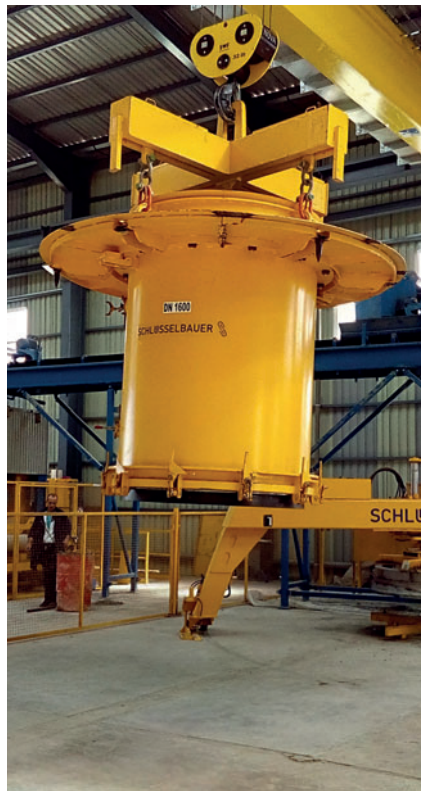
Feed pipe of a prepared steel mould on the Exact XL production system.

Bell sleeve pipes in nominal widths of DN300 to DN1200 are manufactured on the Precise system in single production using the vibration press process, whilst the Exact XL machine is primarily used to produce pipes with larger internal diameters, from DN1400 to DN2000.