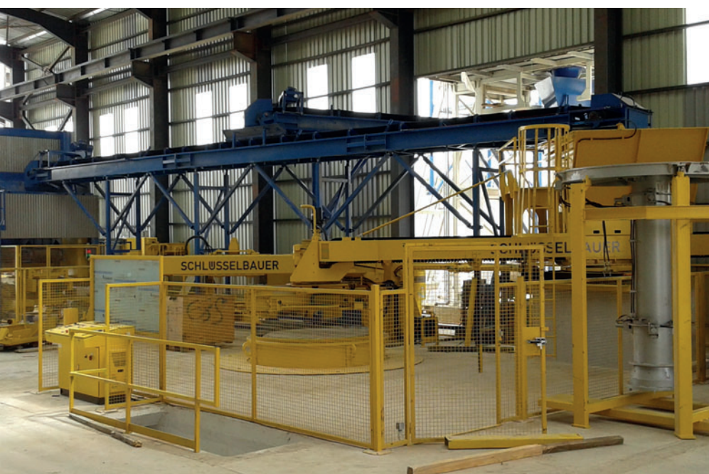
Exact XL automatic pipe production system in the concrete factory of Trans-Canal Centre in Algiers.

Trans-Canal Centre took the decision in favour of the technology produced by the Austrian system construction company Schlüsselbauer Technology based on a detailed profitability analysis, taking into consideration the production capacity predicted, the investment sum and the current production and maintenance costs. The clearly positive result of the analysis and, in particular, the high product quality of the pipes that can be produced with both of these types of systems, which have been successfully used throughout the world for many years, represented a solid basis of decision-making for those responsible at Trans-Canal. As a result, in the winter months of 2015/16 both a Precise and an Exact XL concrete pipe production system were installed by Schlüsselbauer at the main site in Algiers. The acquisition of both modern production systems contributes considerably to achieving a significant improvement in products and processes at Trans-Canal.