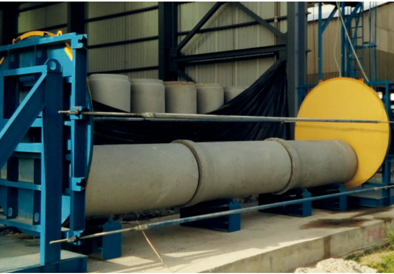
The concrete pipes produced on the Exact XL and Precise machines are tested for watertightness and load capability.