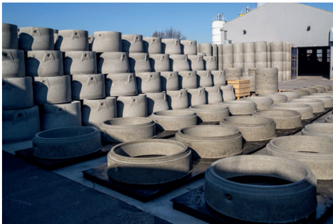
Warehouse overall view