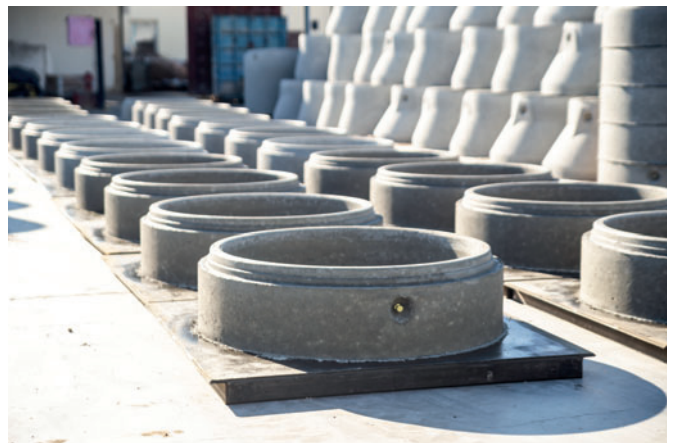
Ball head anchors, securely compacted into the concrete using vibration, provide the basis for safe handling through to its installation on the construction site.