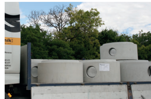
At the second company site, Perfect concrete manhole bases are produced with tailor-made channels and, in most cases, integrated gaskets.