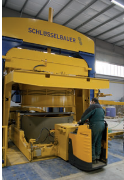
The support ring manipulator permits the operator to effortlessly place the support rings on the new product without being assisted by a second worker