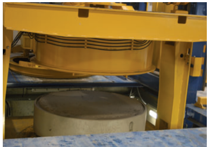
Running the rings out of the machine in short cycle times