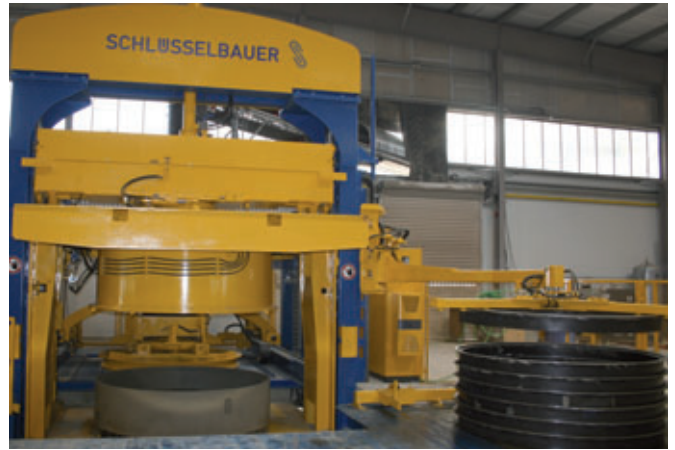
The Magic2500 production plant for the manufacture of precast components with an external diameter of up to 2700 mm

The company which specialises in the manufacture of concrete components for sewerage technology, drainage technology and separation technology has belonged to the MABA group since 2004. At the Chvaletice site, 47 employees recently developed a total turnover of 4,000,000 Euro (2011). With a manufacturing volume of more than 8,000 cbm of concrete annually, Eurobeton is one of the lead-