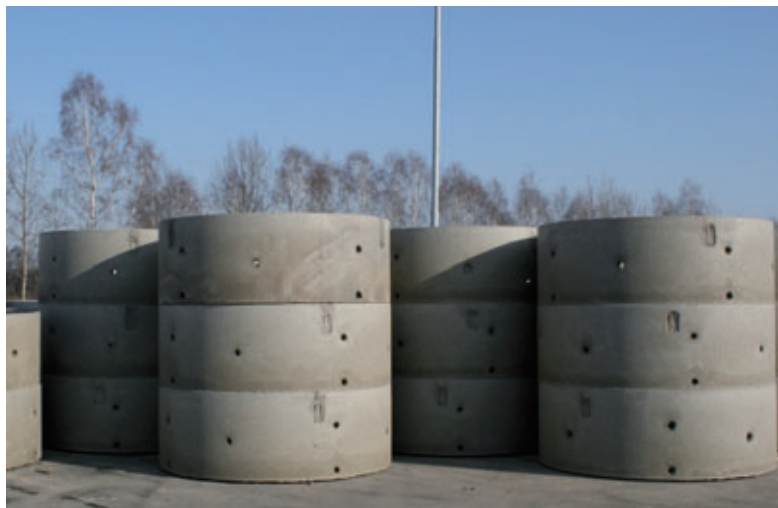
Drainage rings on stock