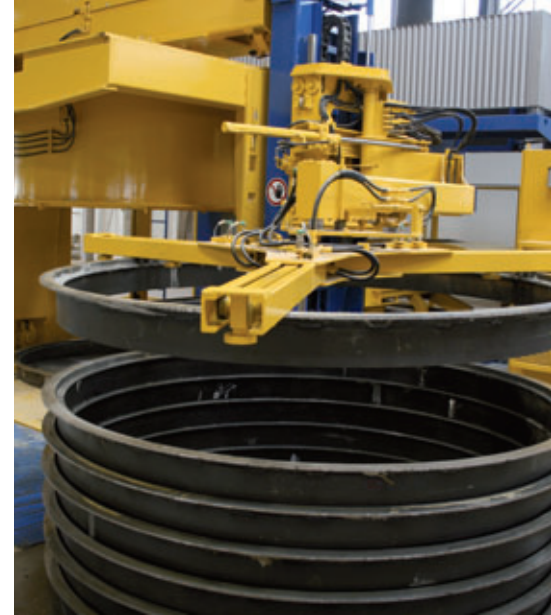
The automatic pallet feeding device is a crucial element in the one-man operation of this plant.

used. In the decision-making phase, the Magic2500 was ascertained as the plant which would be able to implement the specifications. The Magic2500 is a production plant which enables predominantly large-format precast components to be manufactured economically with the flexibility of the Magic. For DN2500 manhole rings the envisaged over 20 % reduction in the concrete used was achieved, for DN1500 and DN2000 manhole rings the reduction was even more than 25 %.