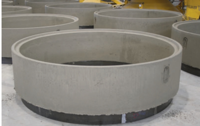
DN1500 manhole rings in the setting area

AGRU Kunststofftechnik GmbH A - 4540 Bad Hall tel: +43 (0) 7258 790 - 0 fax: +43 (0) 7258 3863 e-mail: Agru-CWW@agru.at internet: www.agru.at