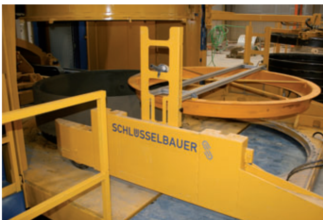
An innovation in the manipulation of support rings – a manipulator undertakes the work-intensive process of fitting support rings

A new concrete supply has also been installed for the feeding of the Magic2500 production plant. The two planetary mixers have a capacity of 1.5 m 3 each. The concrete is transported to the machine using a new conveyor with two buckets of identical volume. The machine has a manufacturing capacity at an external diameter of 2.700 mm and a product weight of 3.000 kg. In order to be able to change the daily production programme quickly over