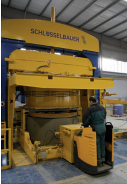
An electrical truck with a retaining ring manipulator used for removal of the products