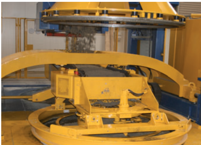
The entire concrete supply of the Magic2500 was newly constructed with a view to rapidly inserting concrete into the machine

ing manufacturers in the Czech Republic. The specification of drastically reducing the wall thickness of 120 mm which was customary for large-format components on the Czech market whilst simultaneously increasing production quality was crucial for the company in the decision for investment in new manufacturing technology. The aim was to attain a roughly 20 % reduction in the concrete volume