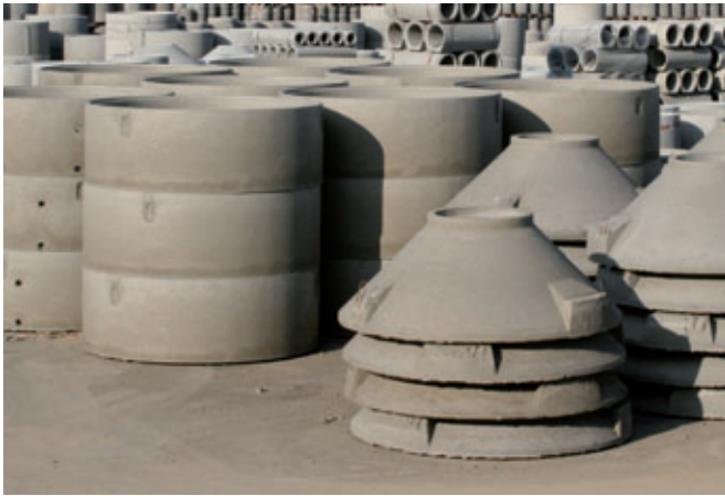
The MAGIC2500 products on stock at Eurobeton Chvaletice: manhole rings, seepage rings, cones

The renowned precast component manufacturer Eurobeton which is located in the Czech city of Chvaletice has started the new year with a noteworthy boost to its production technology. A plant for the manufacture of large format rings and cones was commissioned at the beginning of the year in the company which belongs to the MABA group. This created the basis for the manufacture of products with reduced wall thickness and generally took into account the special significance of this important product segment for Eurobeton customers. With the Magic2500 supplied by Schlüsselbauer, manhole rings, cones and 3 chamber rings to DN2500 can from now on be produced more economically and to higher quality standards than previously. The reduction of costs is due, on the one hand, to reduced concrete consumption, and on the other hand to the one-man operation during manufacture which has now been accomplished. In addition to these basic requirements of a new manufacturing plant, it was predominantly flexibility and the ability to change production over to other products with minimum time expenditure which were crucial for the investment decision at Eurobeton.