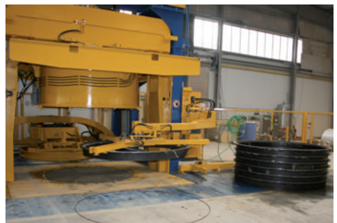
One-man operation of the entire production plant by automated processes, only the insertion of the reinforcement ring is manual.