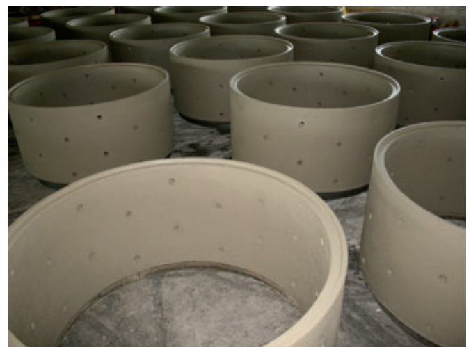
Drainage rings DN2500 in the hardening area.