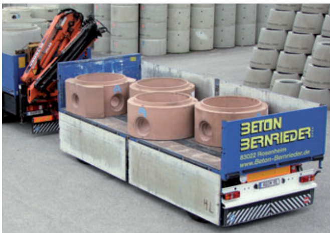
Tailor-made monolithic Perfect concrete manhole bases are produced from standard concrete C40/50 and from high-performance concrete C60/75.

up to DN1000 and manhole nominal widths of DN1000, DN1200 up to DN1500 are created in the Perfect production technology.