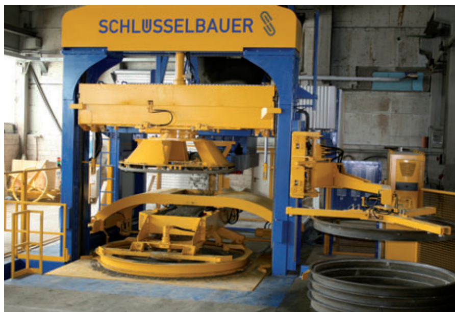
The Magic 2500 production system for the manufacture of precast elements with an external diameter of up to 2,700 mm.

The Magic2500 is a production system, on which large-format precast elements can be produced economically and with that flexibility so familiar to the Magic concept. The production capacity of the machine runs to an external diameter of 2,700 mm and a product weight of 3,000 kg. The Magic 2500 has a quick mould exchange system that allows the daily production programme to switch smoothly to other widths or products. The system can be converted in less than an hour with the result that significant output is guaranteed even if the production schedule has to be changed at short notice.