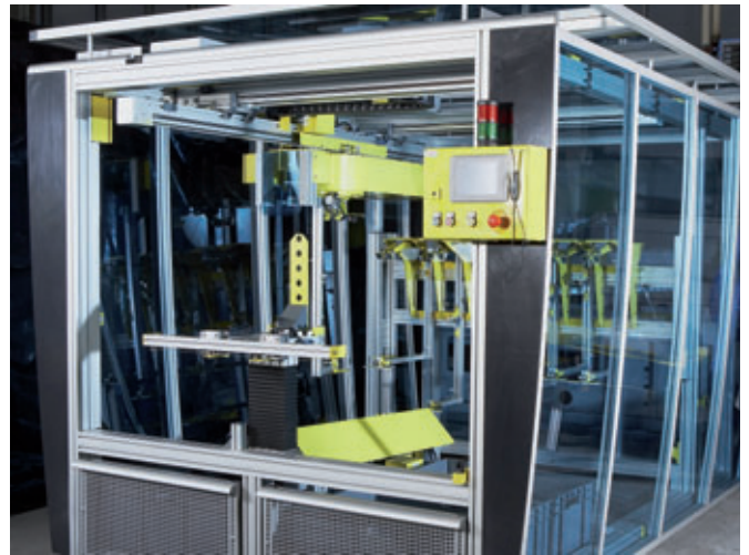
The hot-wire saws that have proved so successful over the years in everyday production are used to produce the EPS-negative channel moulds for the Perfect production.