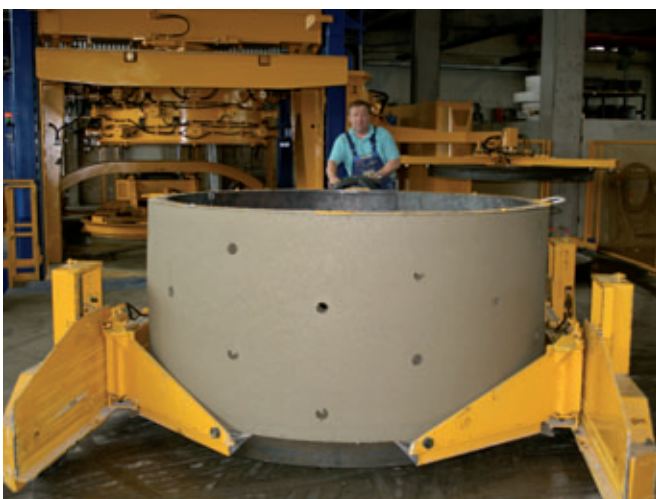
The products are removed from the system in an electrical cart.

Flexibility for Beton Bernrieder however, is not just essential in its own production. In particular in duct construction, the objective is to make it possible for planners and decision-makers to install sewage lines with an ideal hydraulic course and correspondingly greater service life for the entire system. In this respect the hubs of the sewage systems - manhole bases - will in future be adapted 100% to the project requirements. Alongside the number and diameter, in future the engineer will also specify the angle and incline of the pipe connections required at the planning stage. Pipe connections