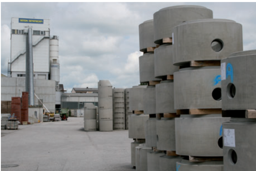
Perfect manhole bases are a common feature in the dispatch area at Betonwerk Bernrieder in Rosenheim since spring 2010.

The Beton Bernrieder family business in Rosenheim sees it as important to constantly gear its range and its in-house production programme to market requirements, to offer customers the very products and services actually required in construction. An important step in this strategy was taken in spring 2010 with the commissioning of a Perfect production system. The move to individual production of monolithic Concrete manhole bases up to a nominal width of DN1500 was the first phase in an investment programme to boost the market position of this traditional company. In the second phase production was switched to a new system for larger manhole components. The Magic2500 supplied by Schlüsselbauer means that manhole rings, cones and 3-chamber rings up to DN2500 can now be made.