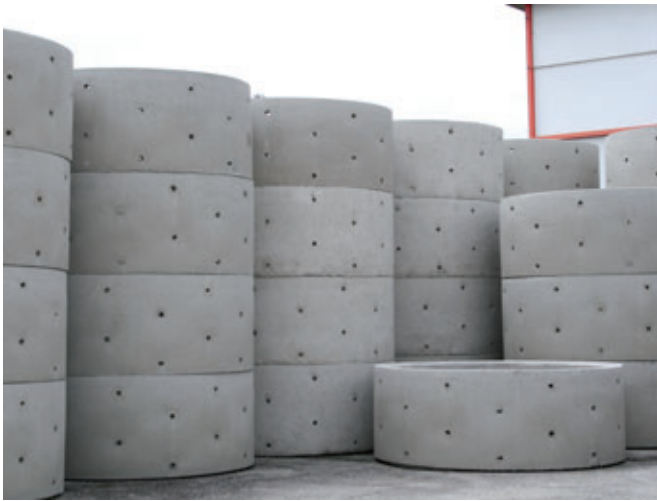
Drainage rings DN2500 in the outside store.