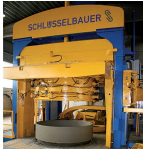
Large-format products in different building heights are produced in very short cycle times by the Magic 2500.