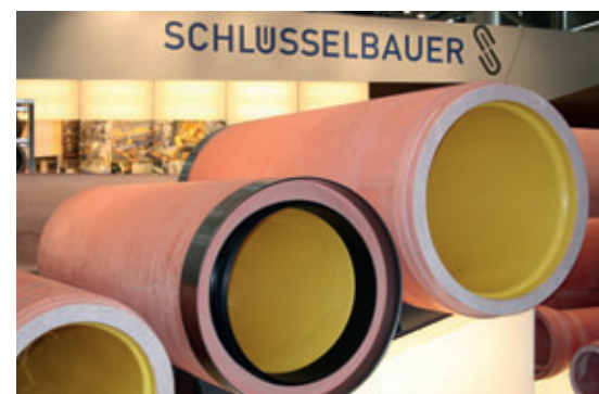
The Perfect Pipe jacking pipes on display at bauma 2013 – from presentation to industrial production in spring 2014