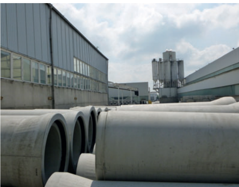
One of Tamara Grafe Beton GmbH's four locations – the site in Stölpchen

Producing jacking pipes was not originally a priority for Grafe Beton. It was only when it came to finalising the design of the Perfect Pipe production between Grafe Beton and