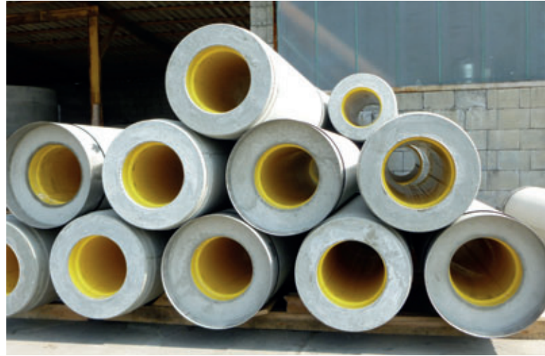
HDPE-lined Perfect Pipe concrete jacking pipes are available from DN300

the supplier Schlüsselbauer Technology that it was decided to consider the increasing global significance of this narrow product segment in pipeline construction from the outset. The vast majority of pipes manufactured by Grafe Beton are used in open installations. These can be both wet-cast concrete pipes with integrated gasket and concrete-plastic composite pipes with HDPE liner for use in projects subject to increased chemical attack. For Grafe Beton, it is a matter of preparing to react quickly to two different and often contradictory market trends. On the one hand, not only in Germany is it becoming increasingly common to construct sewage lines using pipes made out of materials other than conventional concrete or reinforced concrete. On the other hand, a large number of markets are practically experiencing a revival of using concrete pipes as a cast and wet-cast component. This can probably be attributed to the use of self compacting concrete (SCC), which allows a variety of concrete additives to be incorporated, and products