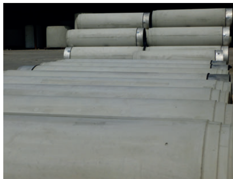
Since 2014 the Perfect Pipe jacking pipe has been manufactured in Stölpchen