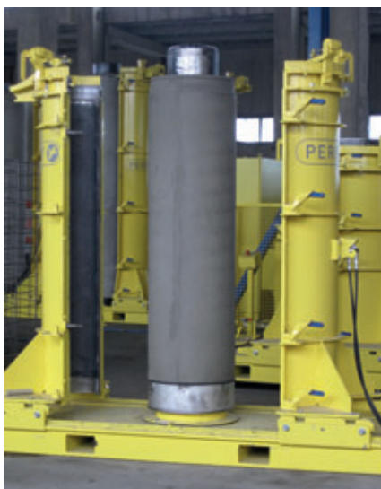
For future projects, the Perfect Pipe jacking pipes are produced to a nominal width of DN300 in 2 m lengths

SCHLÜSSELBAUER TECHNOLOGY GmbH & Co KG Hörbach 4 4673 Gaspolshofen, Austria T+43 7735 71440 F+43 7735 714456 sbm@sbm.at www.sbm.at www.perfectsystem.eu