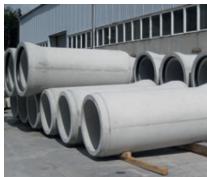
At Grafe Beton, wet-cast concrete pipes are manufactured for open construction up to a nominal width of DN1200