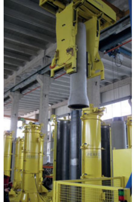
The concrete is mixed using trucks to produce jacking pipes and poured into the moulds using a pail