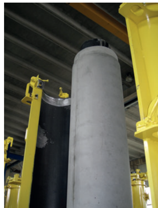
Concrete pipes made using liquid concrete are wet-cast and therefore manufactured to exceptionally low tolerances