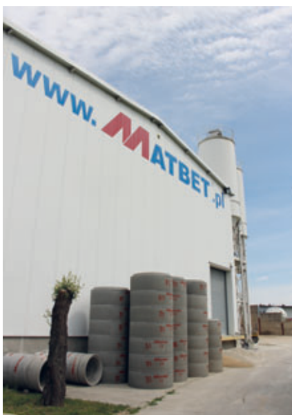
Matbet concrete plant in Tarnowo Podgórne, Poland

At its plant in Poznań, Matbet Beton produces concrete rings, concrete base elements, concrete collecting tanks and concrete manholes, as well as concrete pipes and reinforced concrete pipes in high quantities with its modern, computer-guided systems. It can therefore offer complete solutions for the construction of drainage, sanitary and rain water systems. Matbet Beton is one of the largest manufacturers of reinforced concrete rings and pipes in Poland. All of the products produced are accompanied by the necessary certification and fulfil all of the necessary quality standards. The main production programme is supplemented by road and fencing elements.