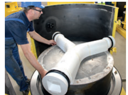
Insertion of a pre-cast negative channel in a steel mould