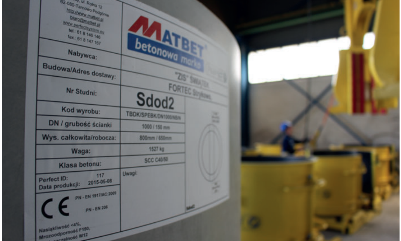
A label containing all relevant details and parameters is applied to the pre-cast concrete manhole bases.

proceeds to the next mould. An employee sticks a label containing all of the relevant data and parameters to the manhole surface of this exact component. The custom-made monolith can therefore be precisely attributed, right up until the moment at which it is installed.