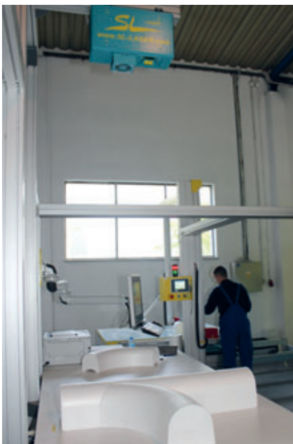
In order to check accurate positioning of the individual components, a laser is positioned over the workbench, which continuously displays inverted of the manhole on the workbench.

The individual negative channel components made from polystyrene rigid foam are cut exactly to shape, so that they can be easily assembled using hot glue to form a single unit, without further manual processing. In order to verify the accurate positioning of the individual components, a laser is