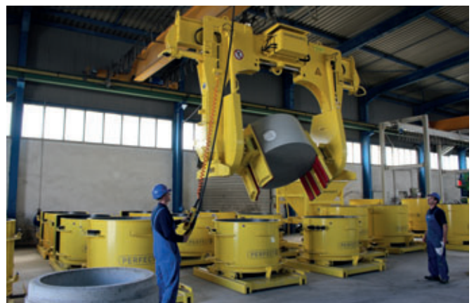
The components are turned 180°.

positioned over the workbench, which continuously displays all floor-lines of the manhole on the workbench. After adhering, the entire negative channel is cut proportionally to the manhole diameter and then supplemented with the required pipe connection pieces. As appropriate, negative moulds for pipe connection with prefitted gaskets are used. These integrated seals are then cast in concrete together with the channel in a joint working step and form a strong connection with the component. Using integrated seals means that these do not need to be installed on the construction site. The tightness and permanent connection between the pipe and manhole base are guaranteed.