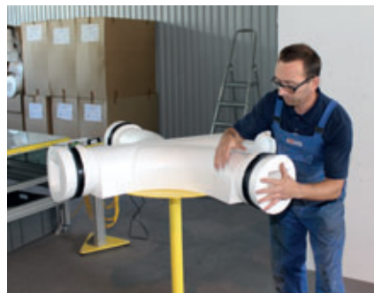
Subsequent fitting of the pipe connection pre-cast components with prefitted seals