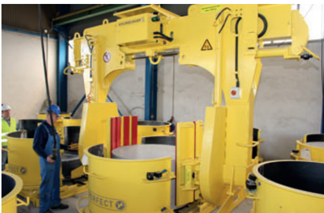
Turning device for components weighing up to 9 t