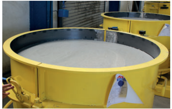
The concrete elements are produced on their head – the visible concrete surface in the mould is what will eventually become the bottom of the manhole base.