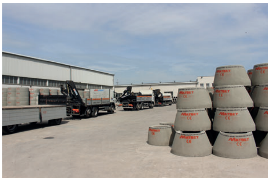
Matbet Beton is one of the biggest manufacturers of reinforced concrete rings and pipes in Poland.