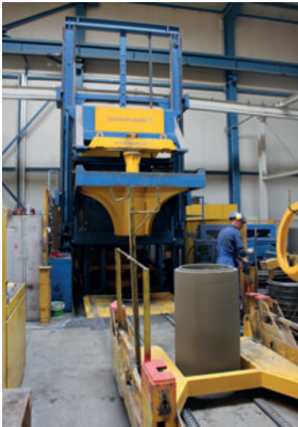
In use at Matbet since 2005: production machine of the Magic type by Schlüsselbauer Technology