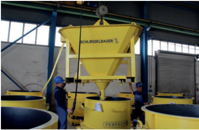
Matbet Beton concrete is then poured using a 2 m 3 container by Schlüsselbauer Technology