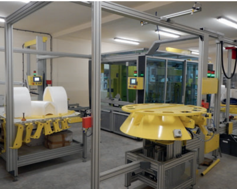
Computer-controlled hot wire cutters are used to cut the negatives for the required channel components accurately.