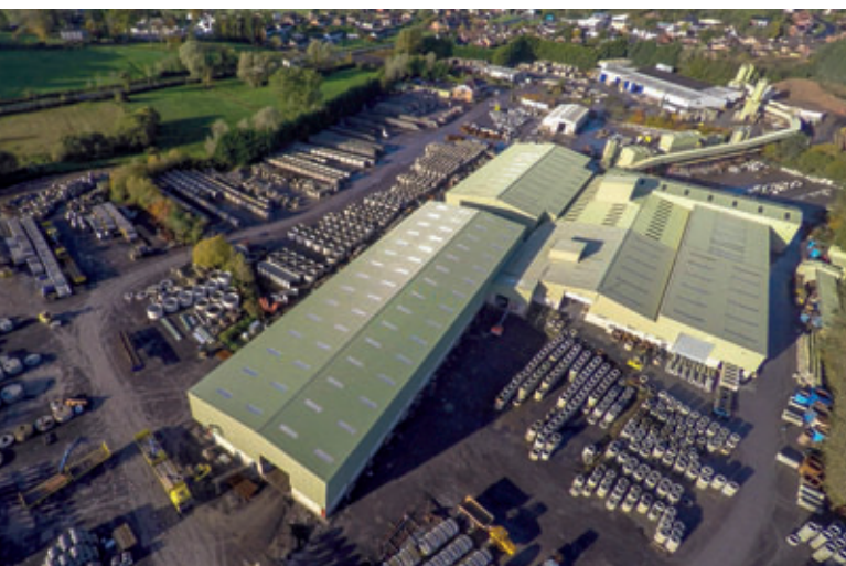
Company premises of Tracey Concrete Limited in Enniskillen, County Fermanagh Northern Ireland.

also in large diameters up to 1800 mm. The Perfect method makes it possible for the first time to manufacture bases of this diameter in an economic and mainly automated process. The scope of supply of the Perfect manufacturing system included a dozen of casting moulds with can be used to produce concrete mono bases in nominal widths of DN1200, DN1500 and now also in a diameter of 1800 mm that are all made in only one pour. The height of the manhole components differs from 700 mm at DN1200 up to max. 1600 mm at DN1800 and can be easily adapted in the mould apparatus. The wall thickness differs from 150 up to 300 mm in the maximum version. The manhole bases can be equipped with or without step rungs. Optionally, Tracey