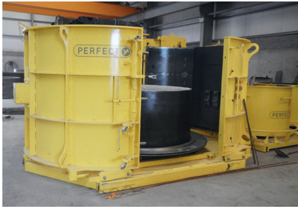
Tracey Concrete produces customised concrete manhole bases with a diameter of 1800 mm by using EPS forming parts.

By choosing the Perfect manufacturing system Tracey Concrete is able to produce cus-