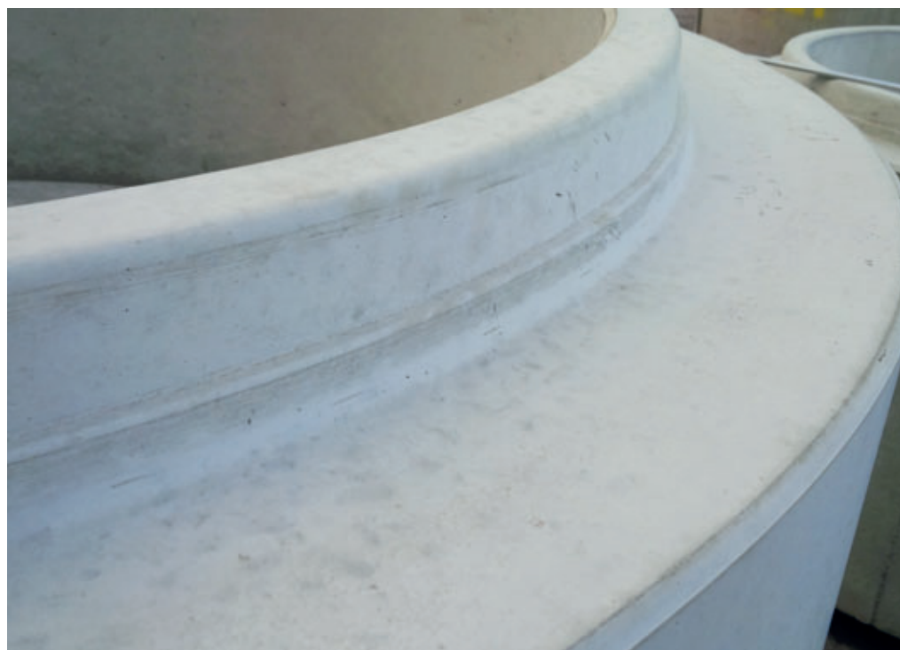
The high quality concrete surface of Perfect manhole bases contributes to an estimated product lifetime of more than 100 years.

tomised manhole bases with individually tailored channel configurations that are made in only one pour. The centrepiece of the Perfect technology is an elaborated moulding program for the individual channel configuration. Prefabricated elements made from polystyrene rigid foam (= EPS), like arcs, straight lines or pipe connection