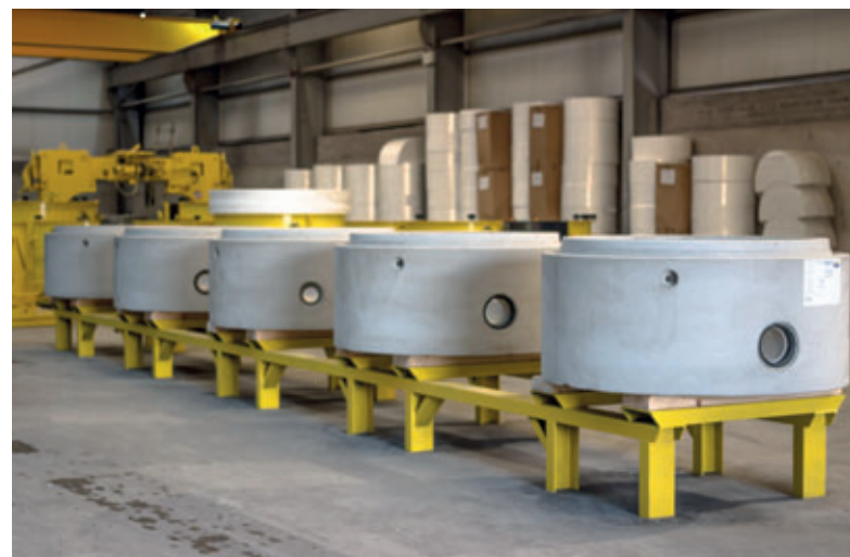
Monolithic concrete manhole bases with individually tailored channels from the current production.