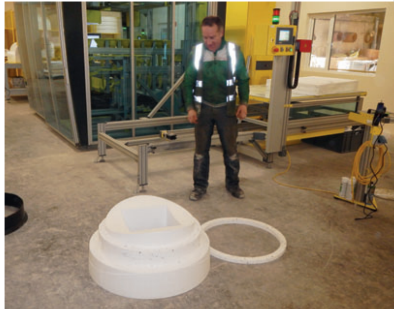
Exactly shaped pipe connection form made from EPS (polystyrene rigid foam).

ferred to the saws from an easy to operate planning programme, which is previously used to configure the manhole base on the computer.